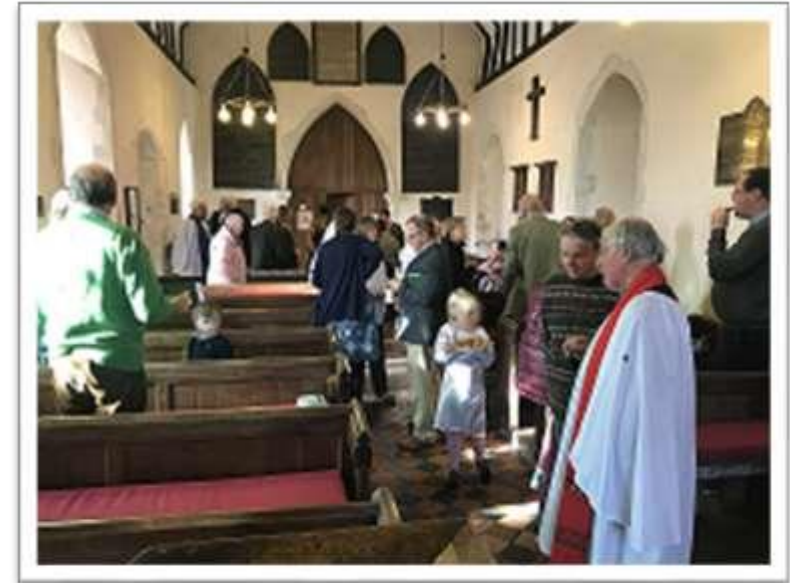
After the service

More information can be found on our website (see above) and also on the village website www.grateley.net