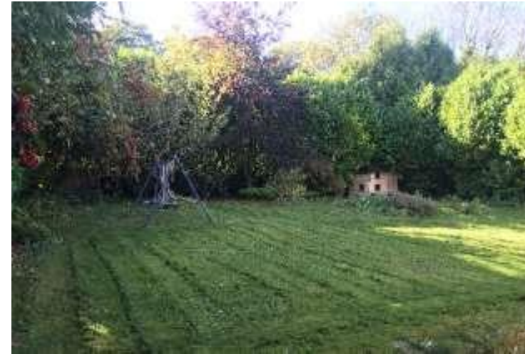
The Rectory, Over Wallop

The House, which adjoins the Church and overlooks the Glebe Field, has recently had a new fitted kitchen and utility room and the proposed works are full decoration and a replacement bathroom.