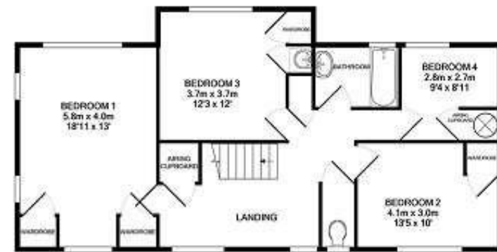
1ST FLOOR APPROX. FLOOR AREA 85.1 SQ.M. (915 SQ.FT.)