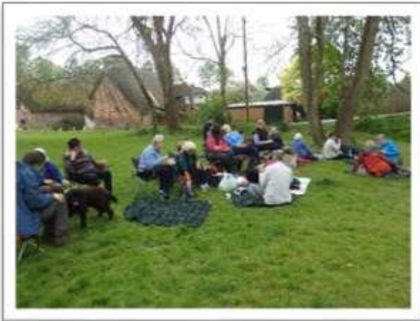
Picnic after open air service on the green

St. Mary's is a Victorian church built on the site of a much older one. We have a small but very dedicated congregation and we are keen to find a way of engaging with the newcomers to the village, many of whom are families.