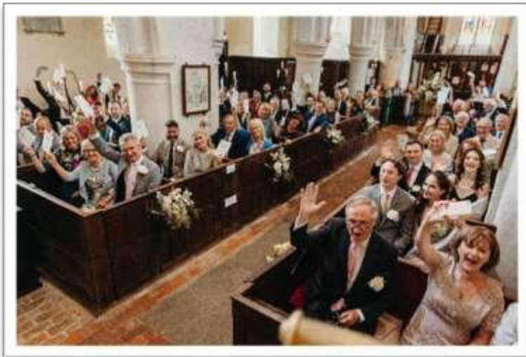
Wedding congregation at St Andrew's