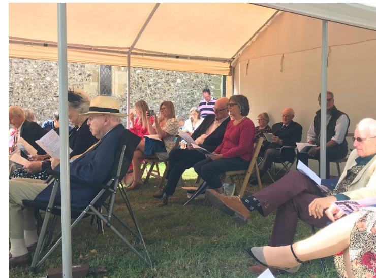
Grateley Church marquee service