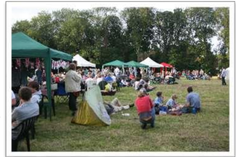
Village Hall fund-raising concert

Nether Wallop is situated under the southwest side of Danebury Hillfort and is proud of its ancient church and pretty village with much photographed thatched cottages and the Wallop Brook alongside the Village Green. Many of the community are retired but there are also several young families with children who attend the nearby Catholic prep school. We also share with St Peter's Over Wallop a Parish Magazine as well as links with the AAC and the Museum of Army Flying. The village community is close-knit with many well organised events. The Village Green and the Village Hall are used by the Church for several events and there are also playing fields and a children's playground on the outskirts of the village. The farms around the village are mostly arable farming - with some sheep, beef cattle and a dairy herd. There are also livery stables, a vineyard and a cut-flower business. Winton House Nursing Home is well-known and ministers have been welcomed to visit, lead prayers or take Communion.