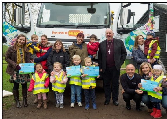
Should we let the Bishop drive the truck?