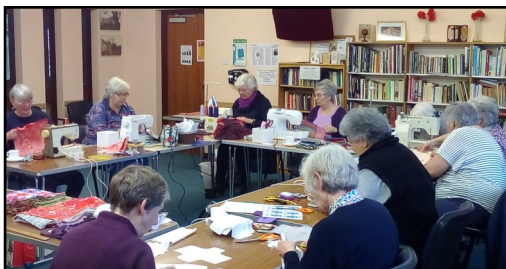
The team at work on the Eve Project

T hose nifty with a needle and thread at St Mark's, Highcliffe , have begun the 'Eve Project' in support of the Christchurch Deanery link with Kinkiizi, Uganda.