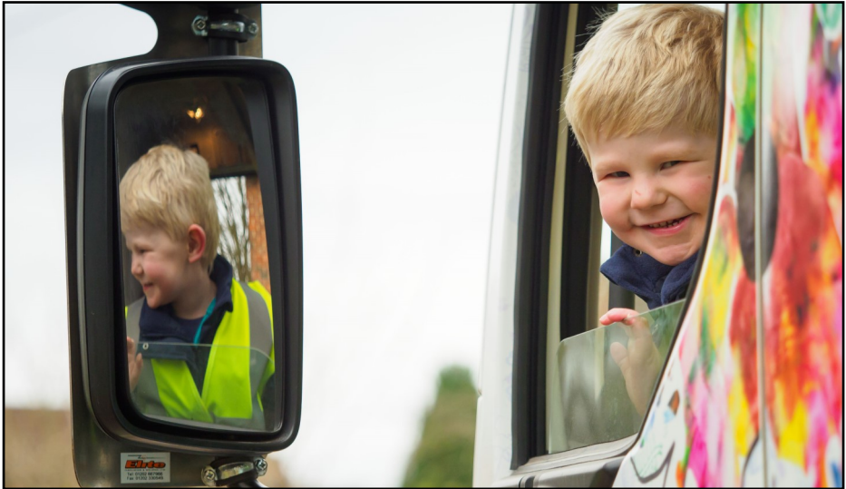
Why did the truck go to pre-school? Answer on page 3.

W elcome to the March issue of Live the Mission bringing you news from across the Diocese of Winchester.