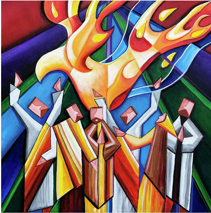
Modern acrylic painting

Here are two contrasting (very different) paintings illustrating events at Pentecost, a time when the Holy Spirit descending to the apostles and followers of Jesus.